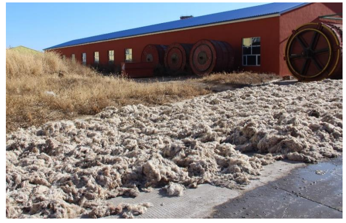
Wool recovery is essential at both cottage and major scale.

Recovered wool - washed, drained, dried and graded for sale.