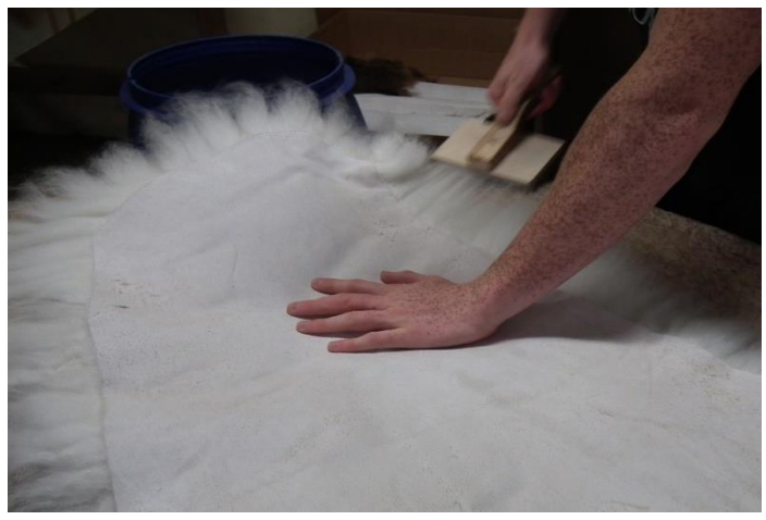
Many different types of wool textures and effects.