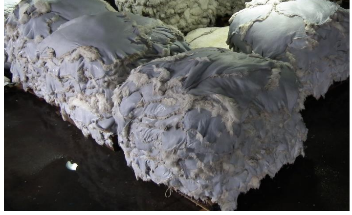
Focus for mechanical softening on the flesh side.

Many selections for skin and wool quality crucial to maximise potential.