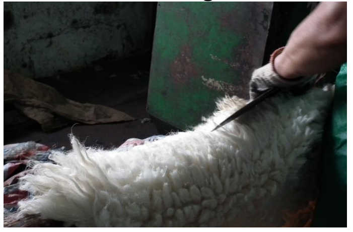
Exceptionally clean/extended flesh layer from second time fleshing.

Hand shearing around the skin after mechanical shearing.