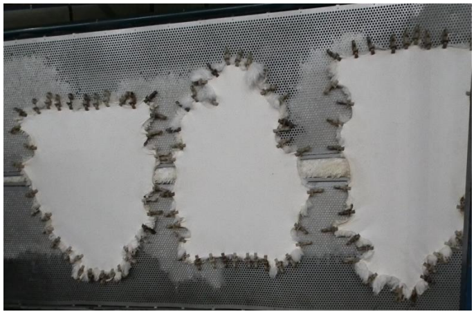
A light toggling may be used after hang drying to flatten and extend.

Setting and toggling produces a flat and firmer structure.