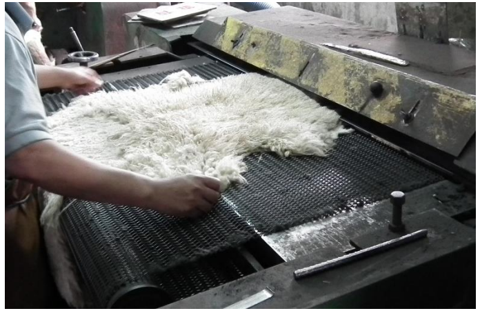
Wool skin following shearing of the butt area.

Feed to the shearing machine fitted with a mesh conveyor belt.