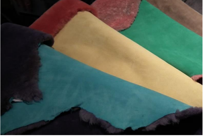
Aniline type finish on wool skin – an alternative to suede.

Classic double face: a combination of fine wool and suede dyeings.