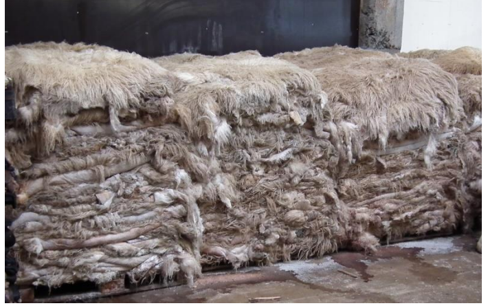
Dry salted sheep from China being tumbled to remove surplus salt.

Long wool sheep, wet salted from sub-artic region of Europe.