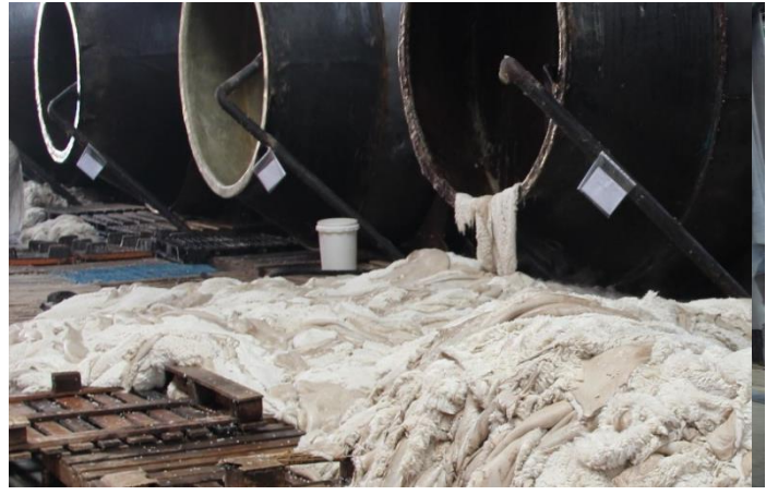
Centrifuge for removal of water from the wool and skin.

Discharged of wool skins following a processor based scouring process.