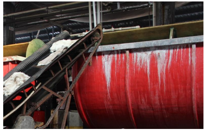
After degreasing, the skins are tanned, then stacked to drain.

Reloading paddles on completion of laying period after pickle.